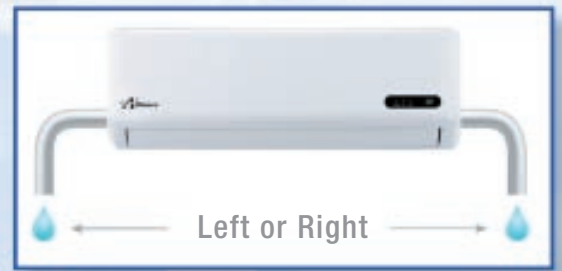
2-Way piping connection